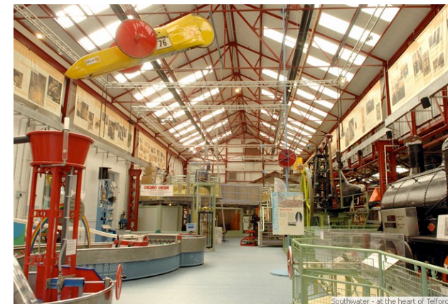
Southwater - at the heart of Telford